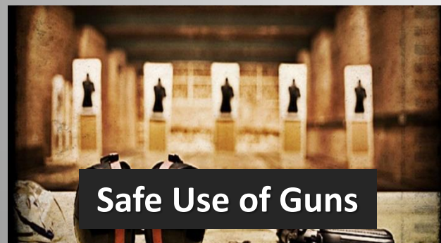
Safe Use of Guns