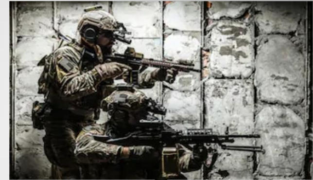
LAW ENORCMENT / MILITARY