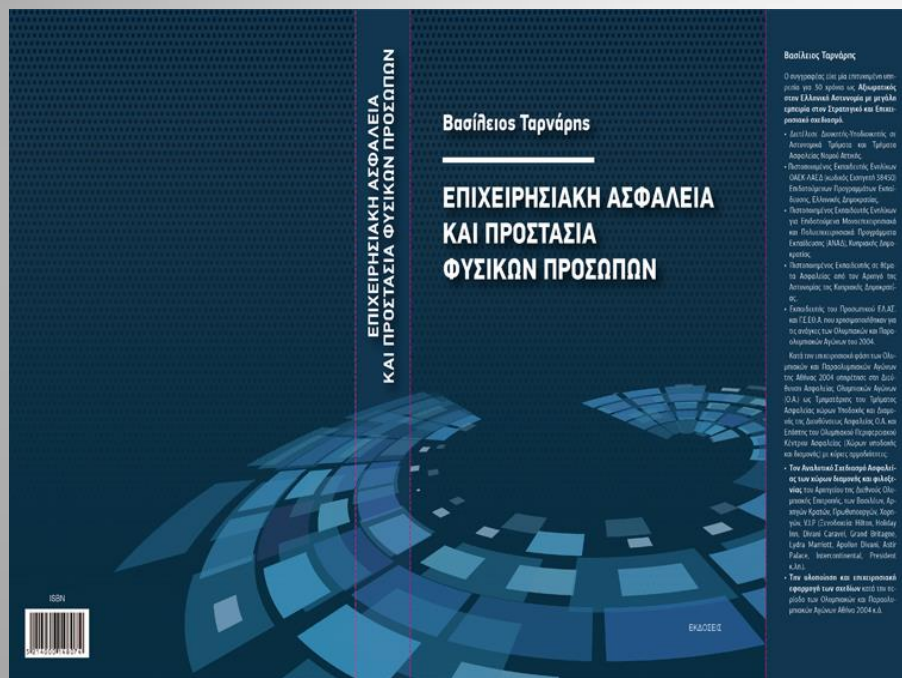
Operational Security & VIP Protection