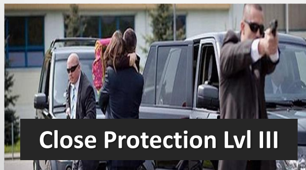
Close Protection Lvl III